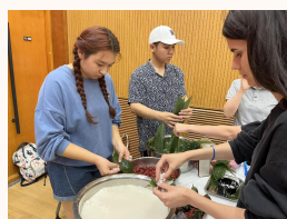
Chinese Traditional Festival